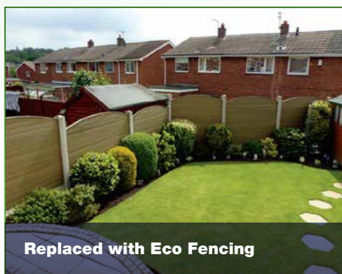
Replaced with Eco Fencing