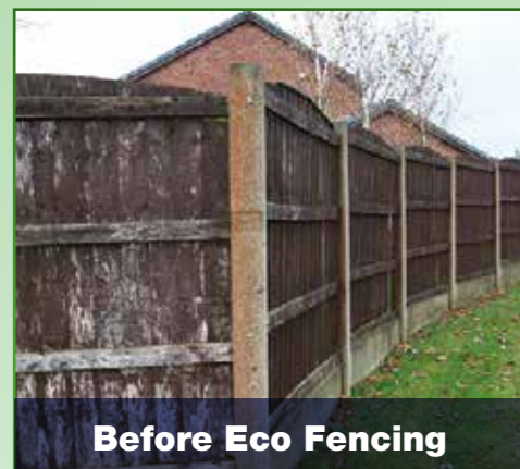
Before Eco Fencing