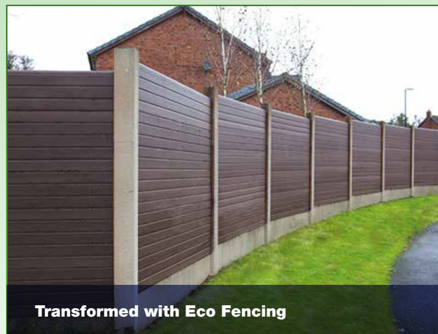
Transformed with Eco Fencing