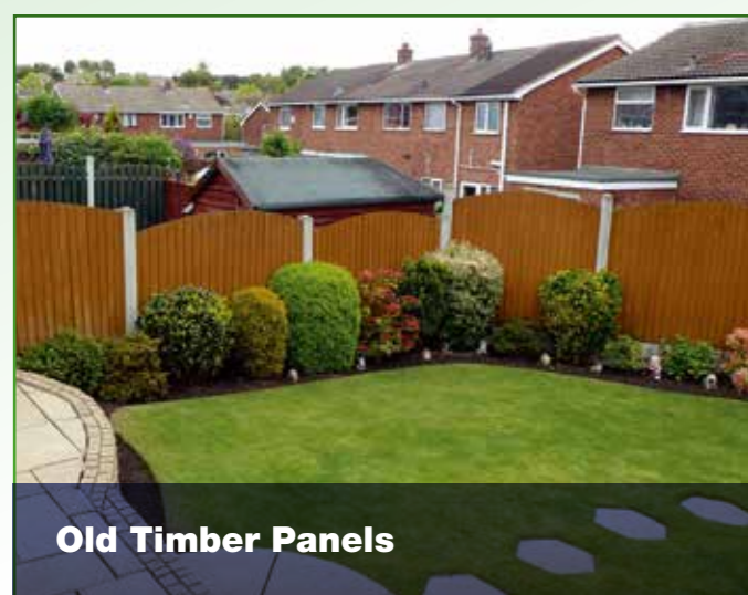
Old Timber Panels